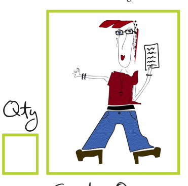
Scooter Owens The Only LIST You should be carrying around is to remind YOURSELF how AWESOME YOU ARE!