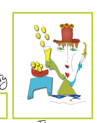
tiona When You DARE to be DIFFERENT, You Inspire People to have the Courage to do the same.