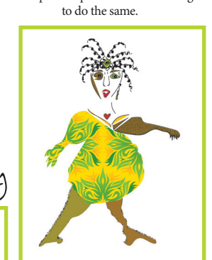
Sometimes our lives need to be Re-Wired in order to function more efficiently.