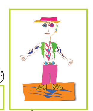
Gemma Be Open to Life's Next BIG Adventure.