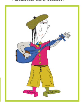
Ziggy When You DARE to COIFFERENT, You Inspire People to have the Courage to do the same.