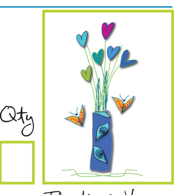
The Magic Vase All EYES are watching what we do with our lives. Change. Expand. Grow. There is Still Time for Magic!