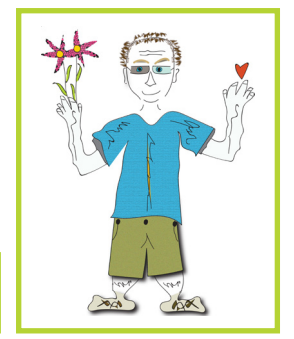
Slooky Rydel It's All Good.